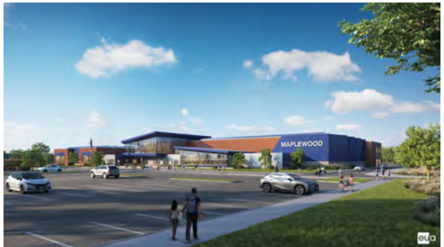
Architect's renderings of the new school exterior

Sustainability: The new Maplewood School will be cost effective, energy efficient, and sustainable while maximizing existing resources.